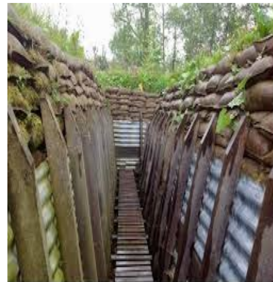
Visitors can walk the trench networks at the International Museum Passchendaele